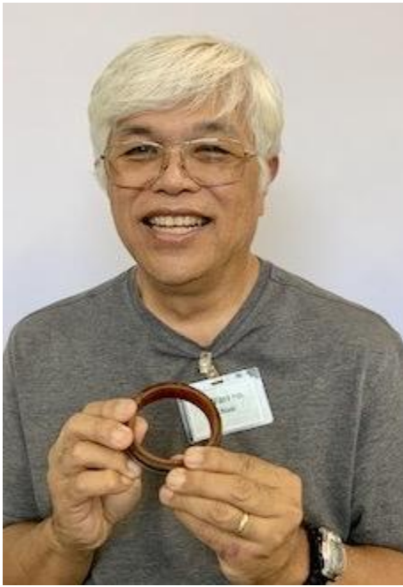
Warren Naai Lychee, Pheasantwood, Turquoise